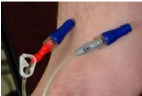
Figure 1- Needleless port