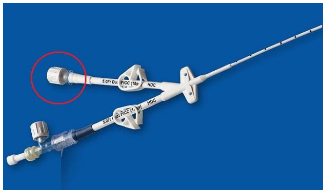
Figure 2 – Non-needleless type port with cap